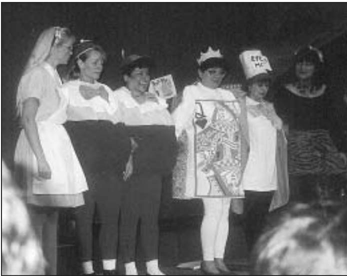
Mt.SAC Financial Aid Staff performs at the 2nd CCCSFAAA Variety Show San Diego – December 1998

In 1996, there was a major effort to increase the CCCSFAAA student scholarships. An opportunity drawing took place at the conference which raised enough funds to expand the scholarships to one per