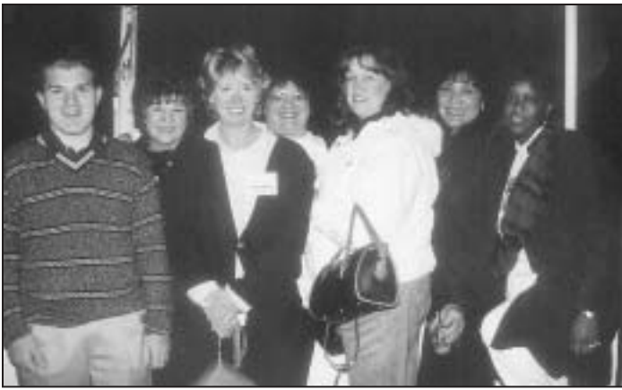
Colleagues enjoy a harbor cruise at CCCSFAAA Conference – San Francisco December 1997