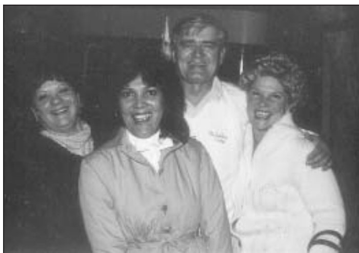
Mt. SAC Colleagues enjoy the conference in Oakland 1983.