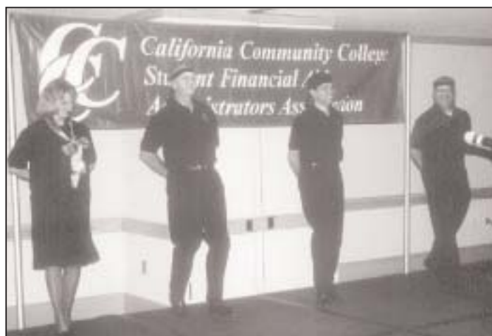
EdFund performs at the first CCCSFAAA Variety Show, San Francisco – December 1997